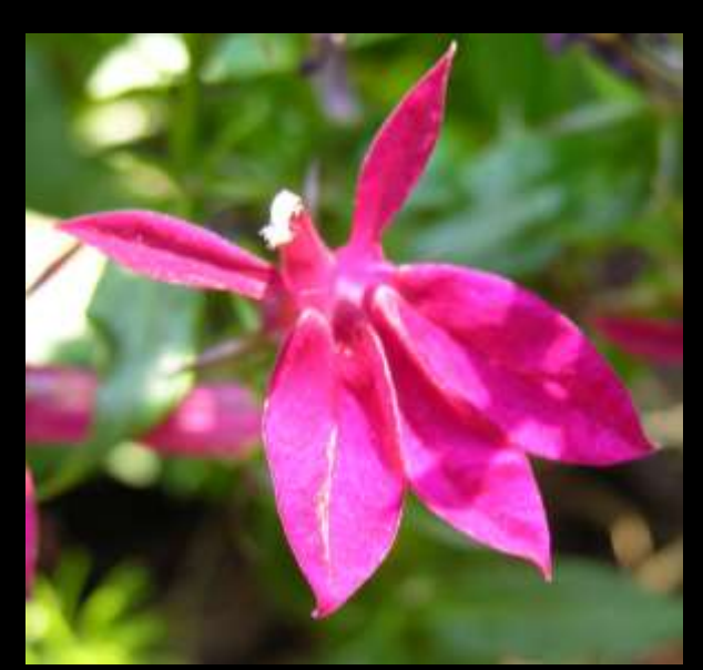
L. 'Fan Burgundy'