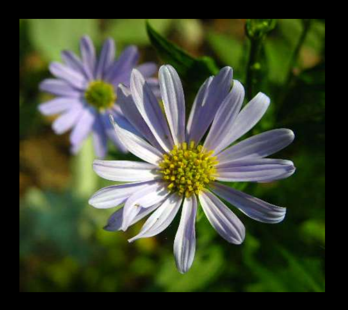
Kalimeris incisa 'Blue Star' (Japanese Aster)