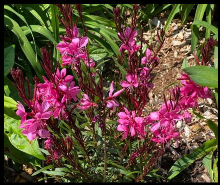
Guara 'Belleza Dark Pink' (Whirling Butterflies)