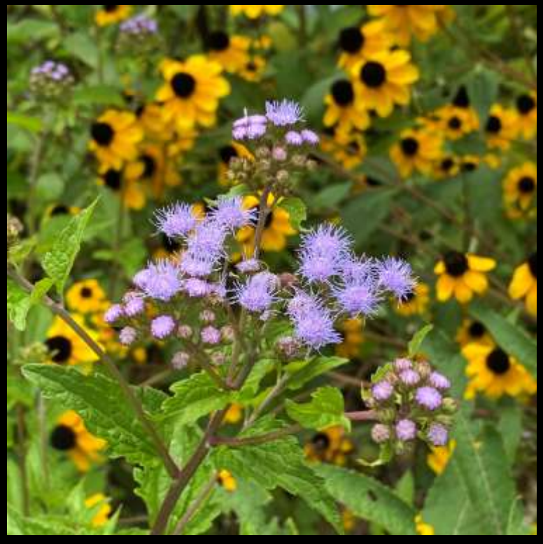
Eupatorium coelestinum (Hardy Ageratum)