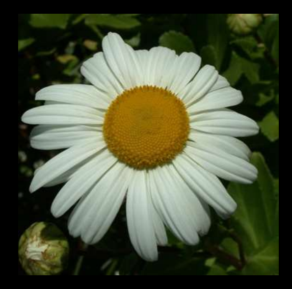
Nipponanthemum nipponicum (Montauk Daisy)