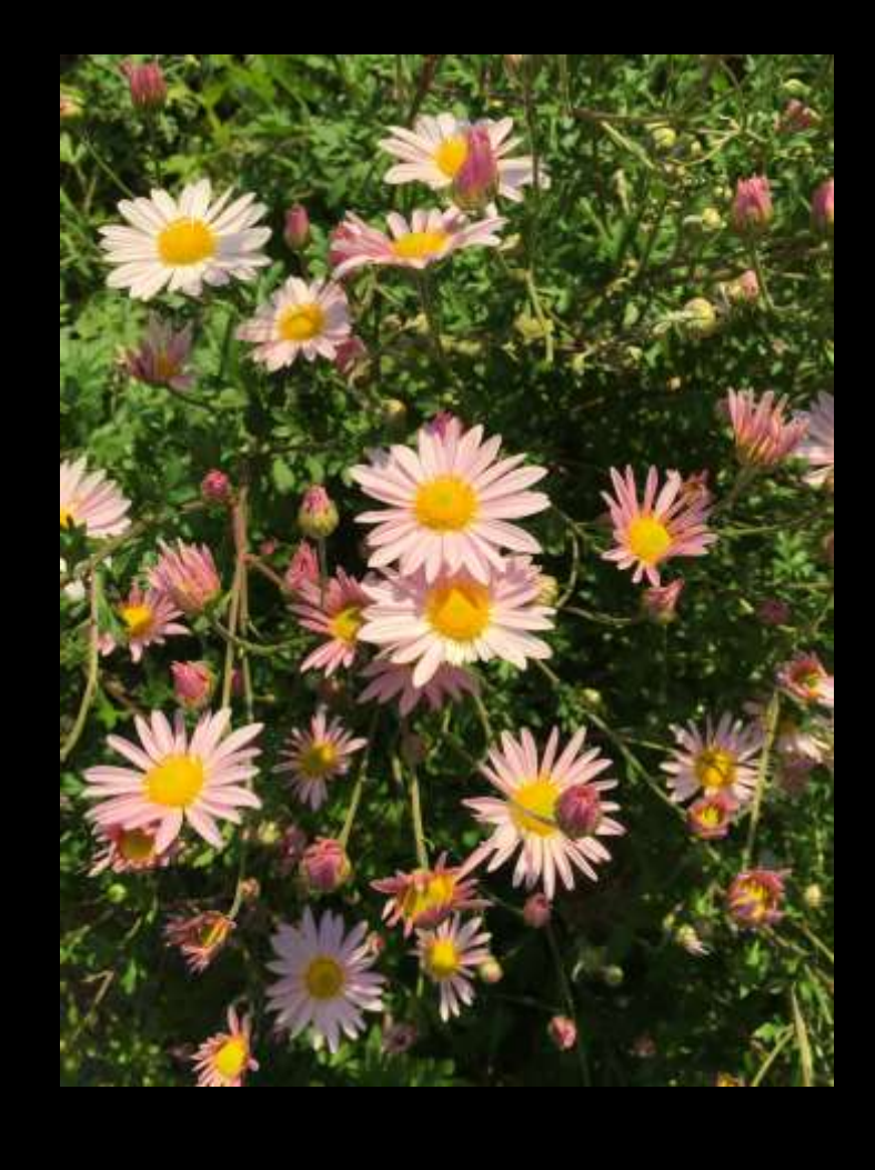
Chrysanthemum 'Hillside Sheffield Pink' (Garden Mum)