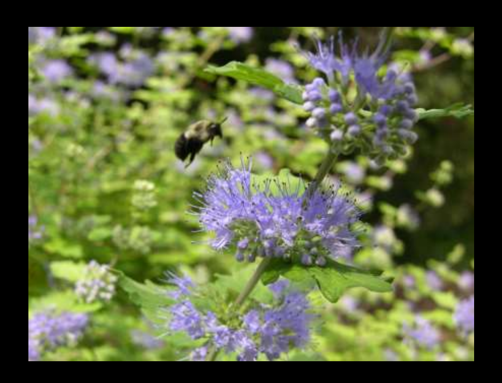
Caryopteris incana 'Jason' (Blue Mist Shrub, Bluebeard)