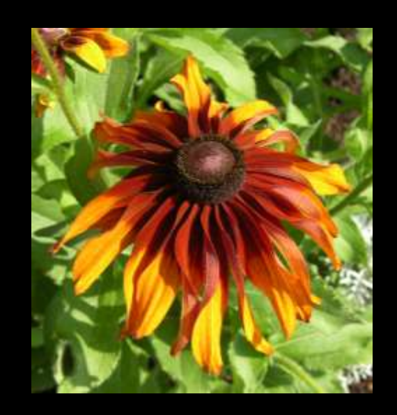
Rudbeckia subtomentosa 'Henry Eilers' (Sweet Coneflower)

Rudbeckia hirta 'Cappuccino' (Black-eyed Susan)