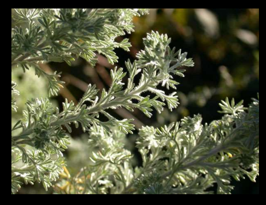
Artemisia ludoviciana'Silver Frost' (White Sage)