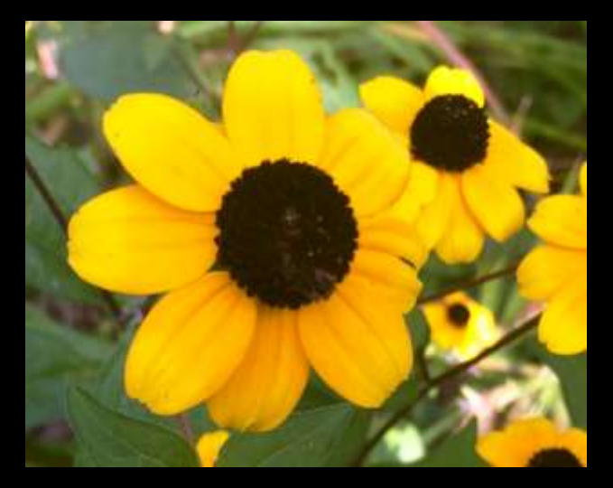
Rudbeckia triloba (Brown-eyed Susan)