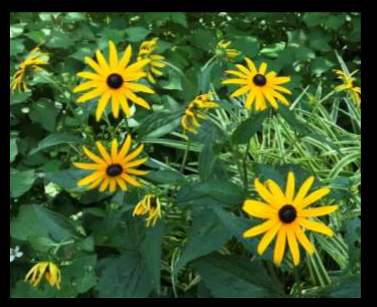
Rudbeckia fulgida (Black-eyed Susan)