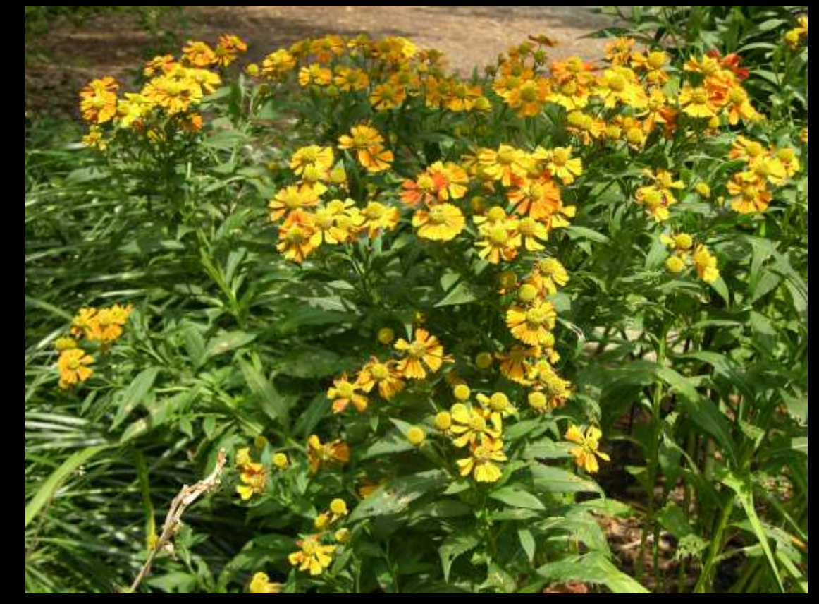
Helenium autumnale 'Butter Pat' (Sneezeweed)

Heliopsis helianthoides 'Summer Sun' (Oxeye sunflower)