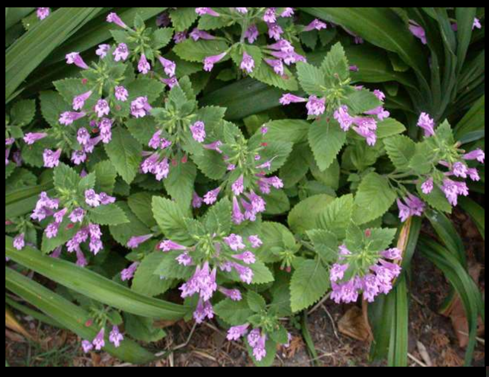
Calamintha grandiflora (Calamint)