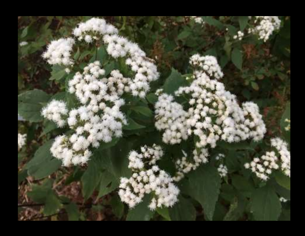
Eupatoriam rugosum 'Chocolate' (Chocolate Boneset)