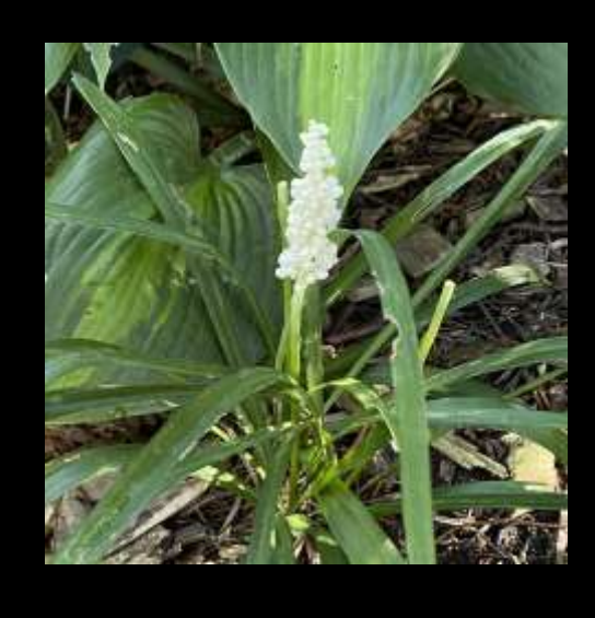
L. 'Monroe's White'