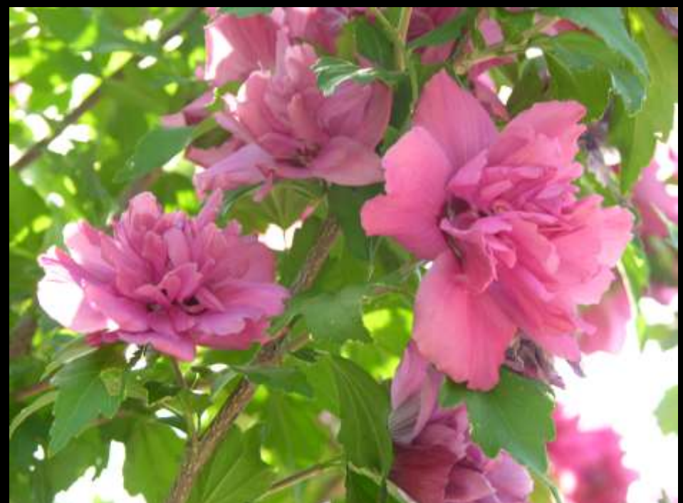
Hibiscus syriacus 'Lucy' (Rose of Sharon)