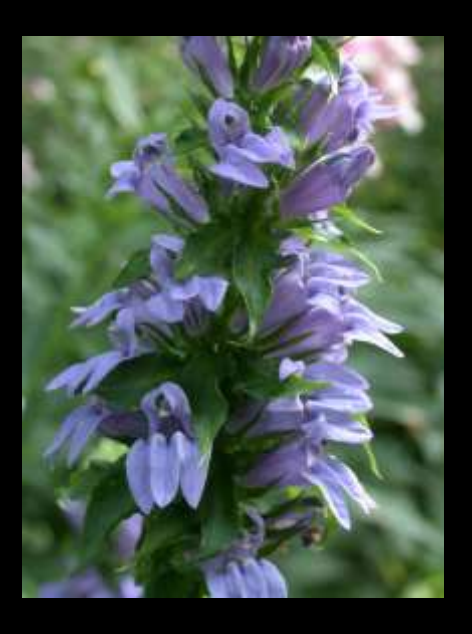
Lobelia siphilitica (Blue Cardinal Flower)