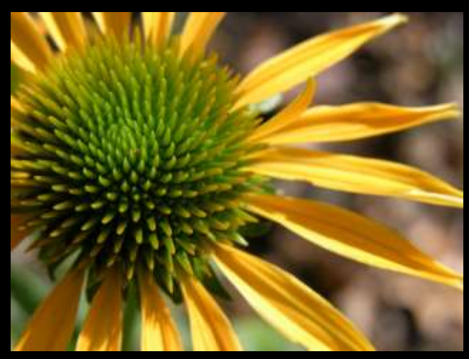
E. 'Mango Meadow Bright'