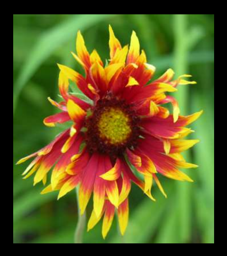
Gaillardia aristate 'Dazzler' (Blanket Flower)