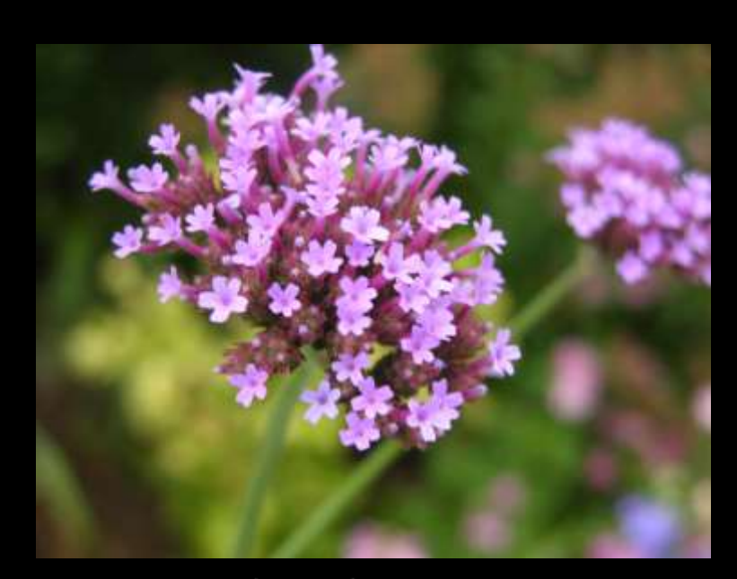
Verbena bonariensis (Brazilian verbena)