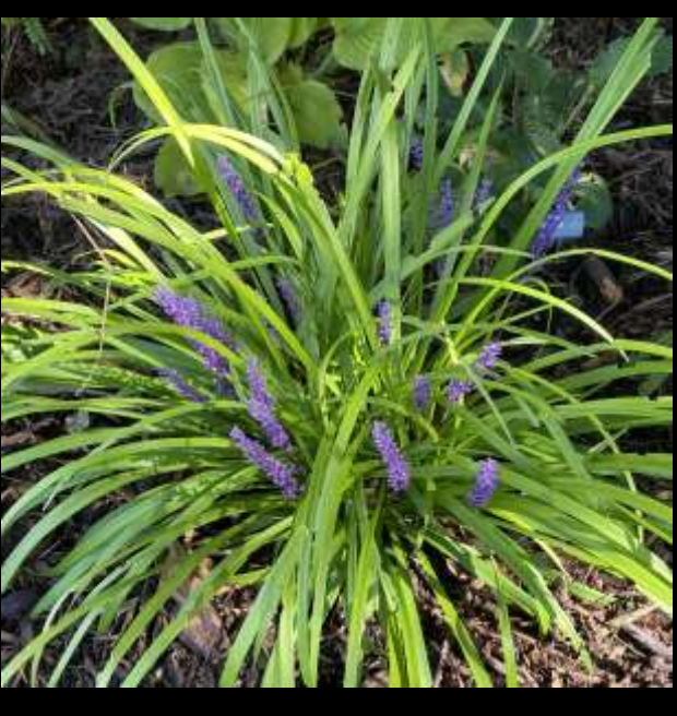
L. 'Pee Gee Ingot'