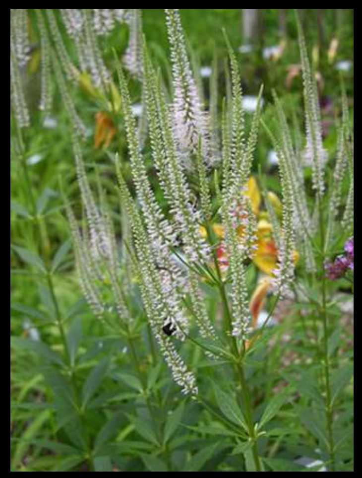
Veronicastrum virginicum (Culver's Root)