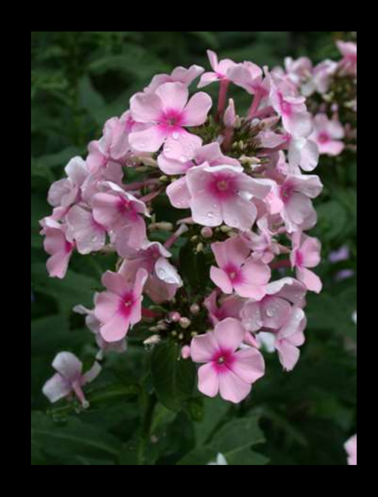
Phlox paniculata 'Bright Eyes' (Phlox)

Perovskia atriplicifolia, Salvia yangii (Russian Sage)