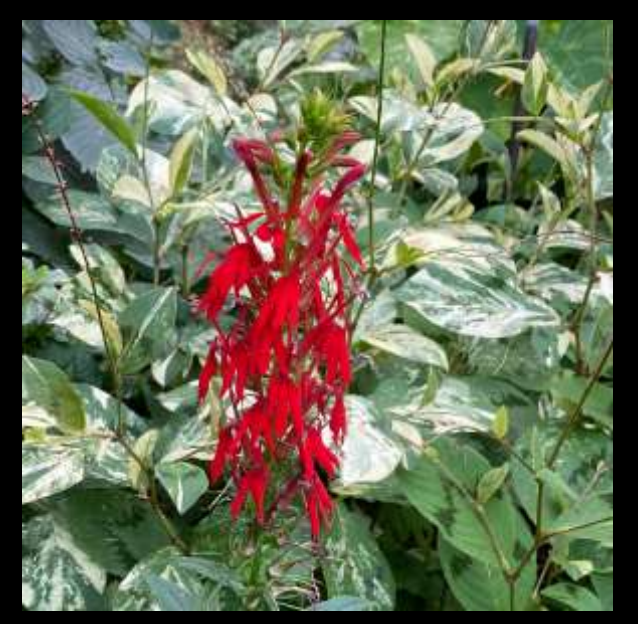
Lobelia cardinalis (Cardinal Flower)