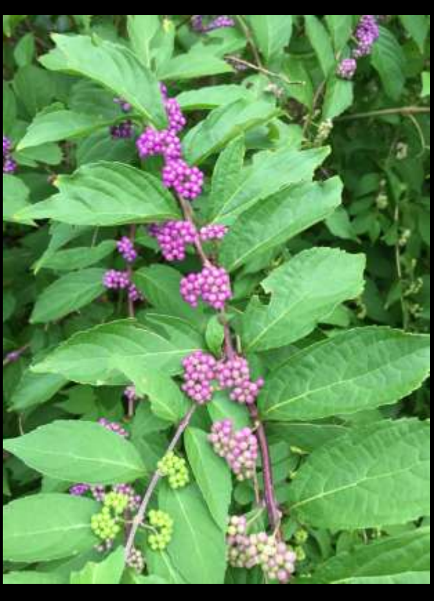
Callicarpa americana (Beautyberry)