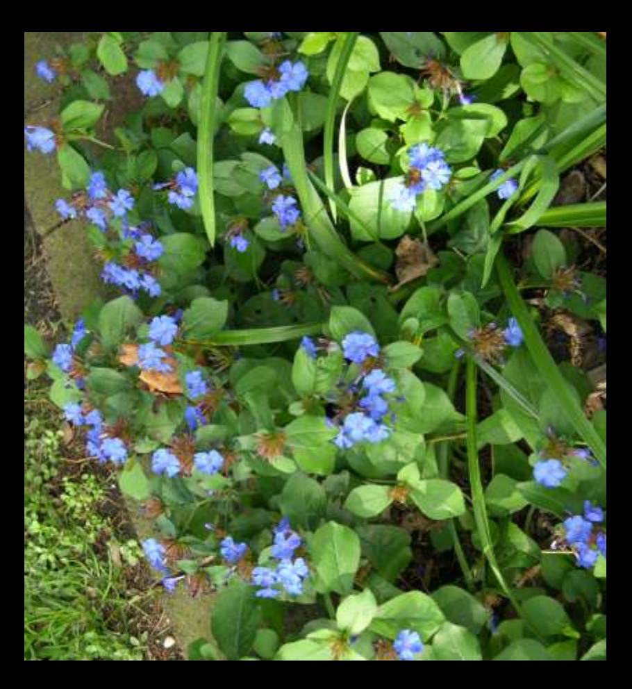
Ceratostigma plumbaginoides (Plumbago, Leadwort)