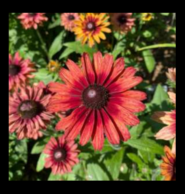
Rudbeckia hirta 'Sahara'