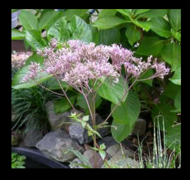
Eupatorium purpurea maculatum (Joe Pye Weed)