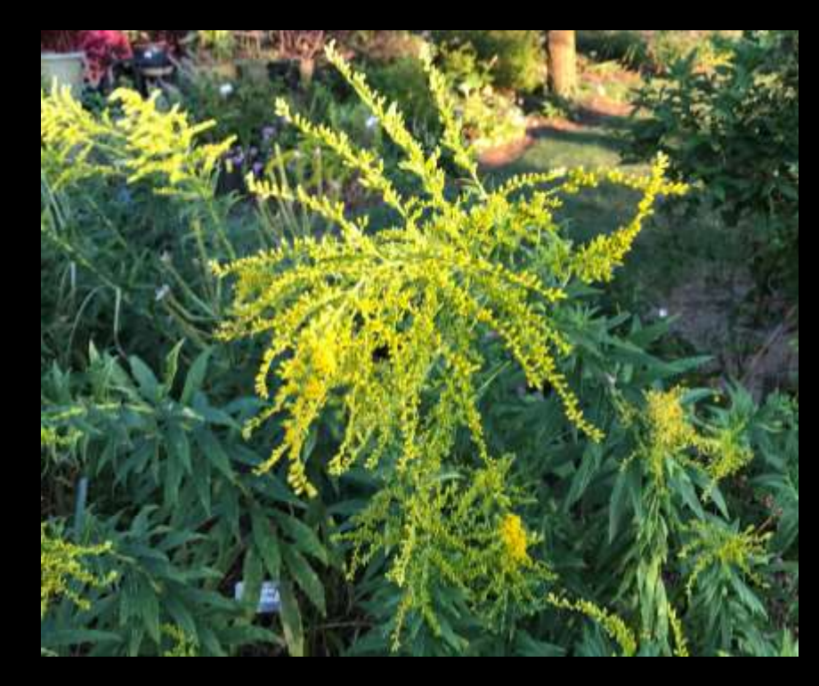
Solidago rugosa 'Fireworks' (Goldenrod)