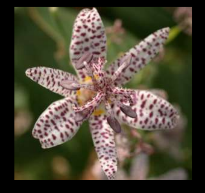
Tricyrtis formosana (Toad Lily)