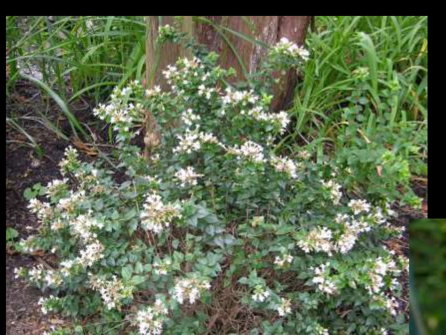
Abelia grandiflora 'Rose Creek' (Glossy Abelia)