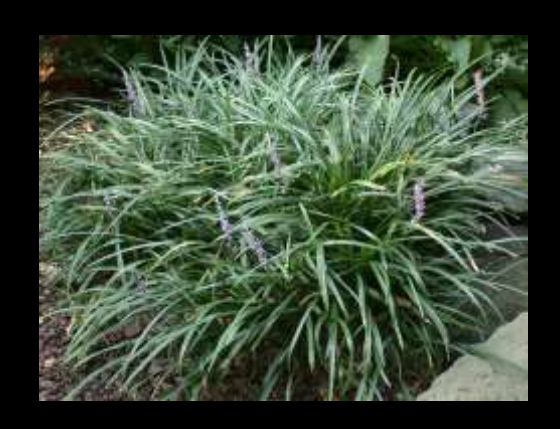
L. 'Big Daddy'