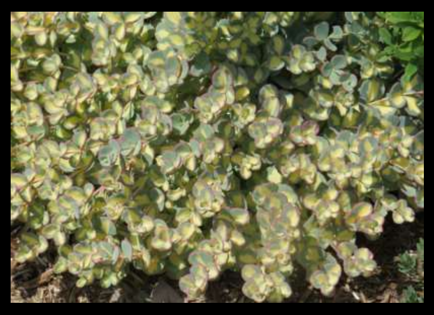
Sedum sieboldii 'Variegata'