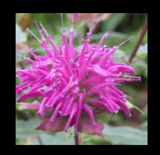
Monarda didyma 'Garden View' (Bee Balm)